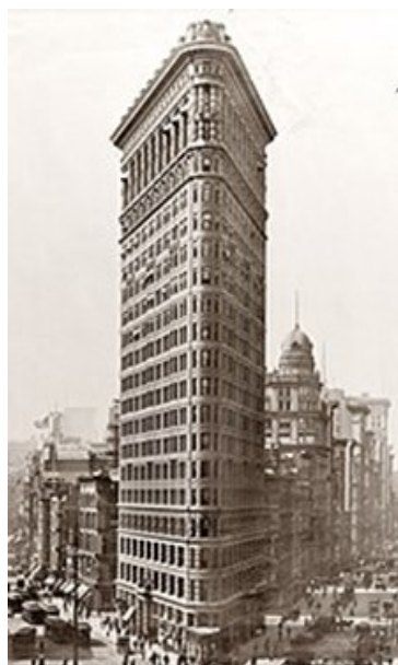
The Flat Iron Building, 1910

The Cleveland Mall today is the centerpiece of the city, providing the green spaces above the Cleveland Convention Center, and was the inspiration of many of the great architectural creations of Cleveland in the early 1900’s. The Cleveland Mall was added to the National Register of Historic Places in 1975. Burnham is also credited in designing Union Station in Washington DC and The Flat Iron Building in New York City, among many others.