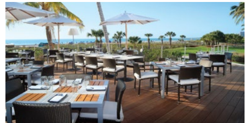
The Deck at 560