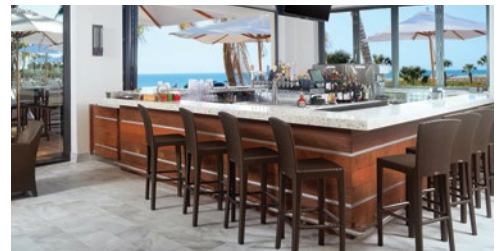
The Bar at 560